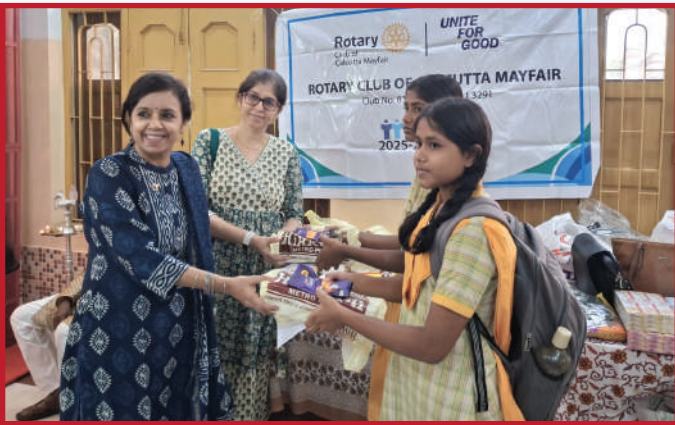
» Chocolate Distribution to 60 children

» Honouring Talent & Service Certificates were awarded to 10 jute-trained girls who completed their skill training. 50 associations were acknowledged for their support. 40 distinguished personalities from various walks of life were honoured for their contributions.