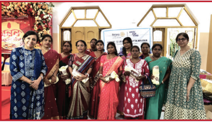
» Saree Distribution to 15 senior citizen ladies